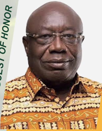
Hon. Dr. Kwaku Afriyie (Minister of Environment, Science, Technology & Innovation)